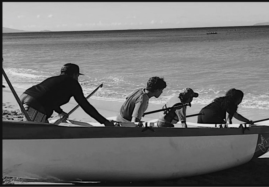
Canoe Surfing with Hawaiian Paddle Sports

Dear Project Venture Participants, Families and Community,